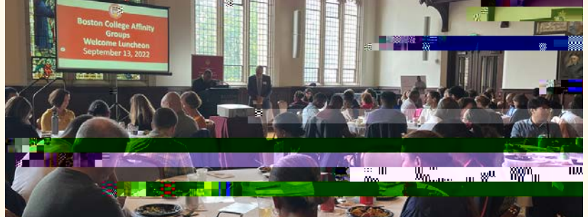
The 2022 Affinity Groups Welcome Luncheon